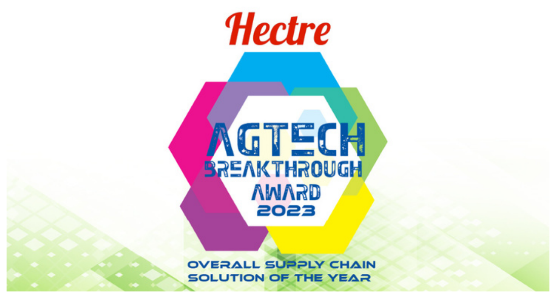
Annual Awards Program Recognizes Innovation in Agricultural & Food Technologies Around the Globe

The mission of the annual AgTech Breakthrough Awards program is to conduct the industry's most comprehensive analysis and evaluation of agricultural and food technology categories, including Internet-of-Things (IoT) and Artificial Intelligence (AI) based agricultural technologies, farm management, indoor farming, food quality, data analytics and many more. This year's program attracted more than 1,750 nominations from over 15 different countries throughout the world.