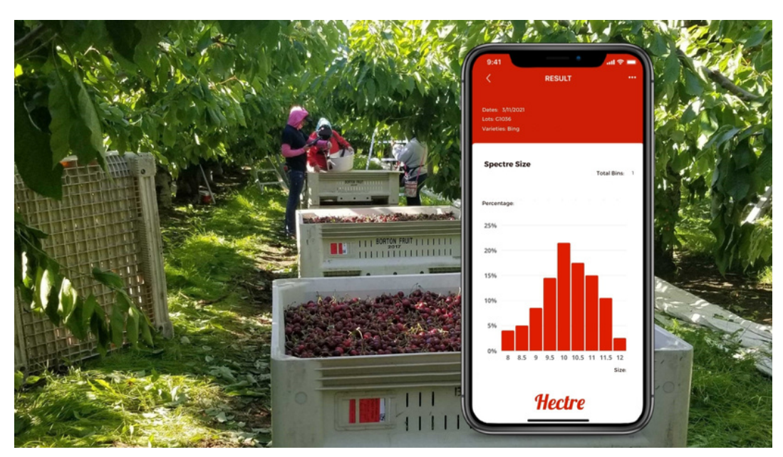
Spectre AI models for premium fruits like cherries, where early size data is crucial, are also provided by Hectre.

Two Spectre core solutions have been released: A hand-held option where users simply take a photo of a bin of fruit on their phone or tablet and receive sizing results in seconds; and a top-down solution where a camera is installed above arriving trucks. More than 5,000 pieces of fruit are detected and sized by Spectre Top Down in one truck pass. Early color grading results are also available.