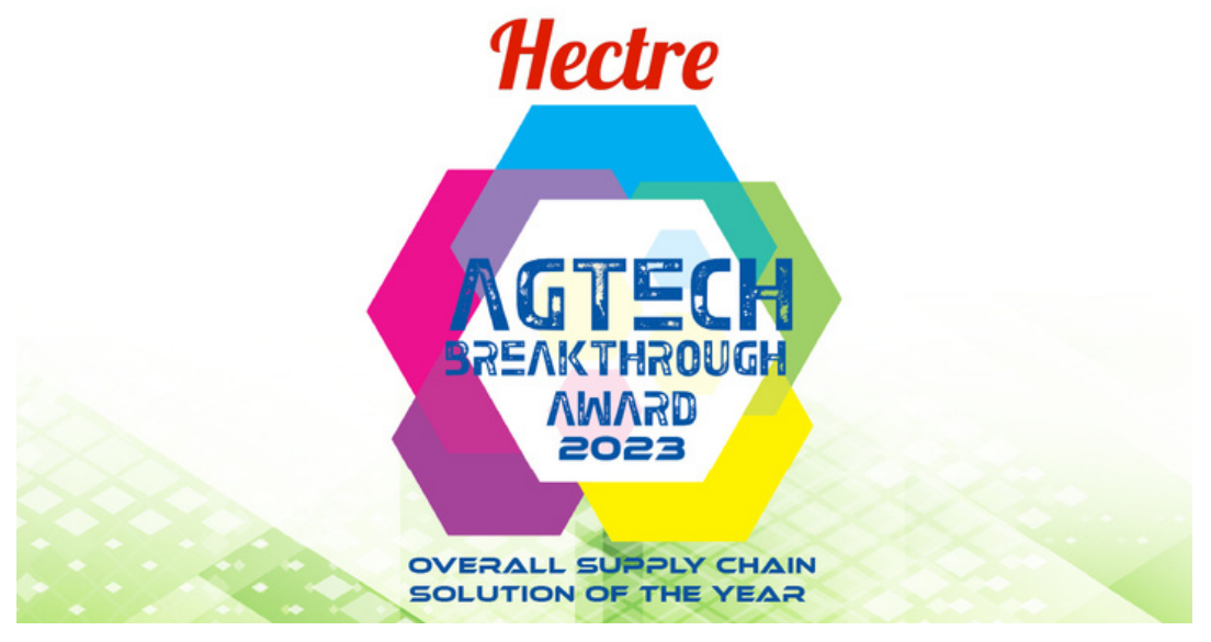
Annual Awards Program Recognizes Innovation in Agricultural & Food Technologies Around the Globe

The mission of the annual AgTech Breakthrough Awards program is to conduct the industry's most comprehensive analysis and evaluation of agricultural and food technology categories, including Internet-of-Things (IoT) and Artificial Intelligence (AI) based agricultural technologies, farm management, indoor farming, food quality, data analytics and many more. This year's program attracted more than 1,750 nominations from over 15 different countries throughout the world.